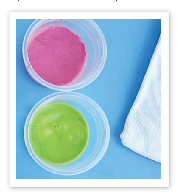
Step 1: Water down the fabric paint by pouring it in plastic containers and mixing it with water.